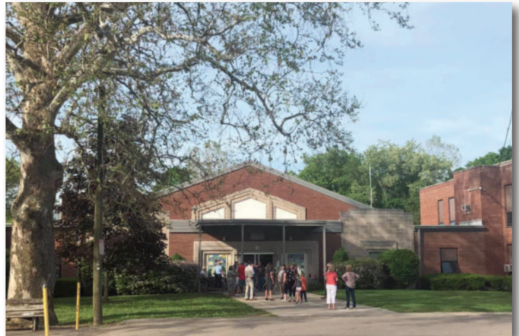
Generations of students, teachers and friends gather to walk the halls of the Alexandria Primary Building.

On Thursday, May 20th, 2021, the community gathered to walk the halls of the Alexandria Primary building to view the classrooms and walls one last time before the end of the school year. The students will be moving to the new Northridge Elementary School for the 2021-2022 school year. Students, teachers and friends took the walk to remember the history of the Alexandria building that has over the many years housed kindergarten through 12th grade. As promised during the campaign for the new elementary school, Northridge School district has budgeted money to demolish the Alexandria building while remaining open to any financially viable plans from the community to re-purpose the building. We are excited about the future, but will always honor the past. ☼